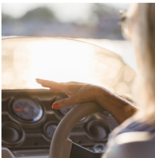
Life on the water is what makes Buckeye Lake so special.

Four professional photos in a defined category $500 annually