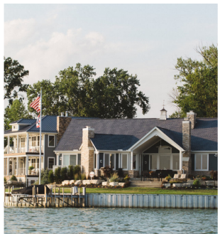
Life on the lake can be laid back and luxurious. Our local realtors, housing developments, contractors, building suppliers, and craftsmen can ensure you find the services you need to make life on the lake a long term possibility.

600x600 Clickable Coupon/Ad $350 per coupon (good for one year)